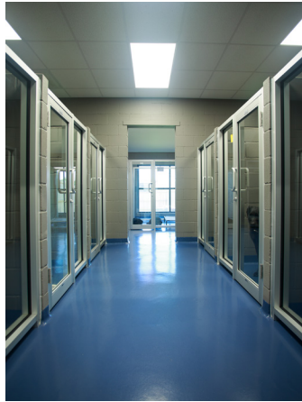
Most Have Outside Views!